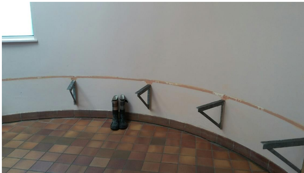
A lonely pair of boots, in the ladies change room, waiting for the return of the benches

Pacific Reach volunteers took on refinishing the benches in the changing rooms and they did an amazing job! It took 80 hours of work to remove the benches, refinish them to bring back the natural quality of the cedar and re-install them.