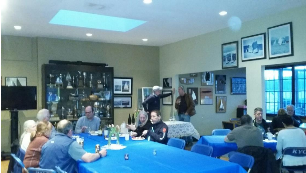
Members at the Welcome Spring dinner on April 27

May 4 , was a suspenseful day; the sky was dark. Would there be thunderstorms? Would there be torrential rains? Hail stones the size of golf balls? Fortunately, none of these happened but, sadly, neither did any wind arrive. The flags on the flagpoles were not moving and, as the paddlers headed off to practice, sail racing was canceled for the evening. The clubhouse filled up with happy sounds, sailors visiting with each other instead of competing, the wonderful aroma of Chef Ed's delicious dinner, and the bar was humming along. By the time dinner was ready to be served, the paddlers were back on shore and a pleasant evening was enjoyed by all.