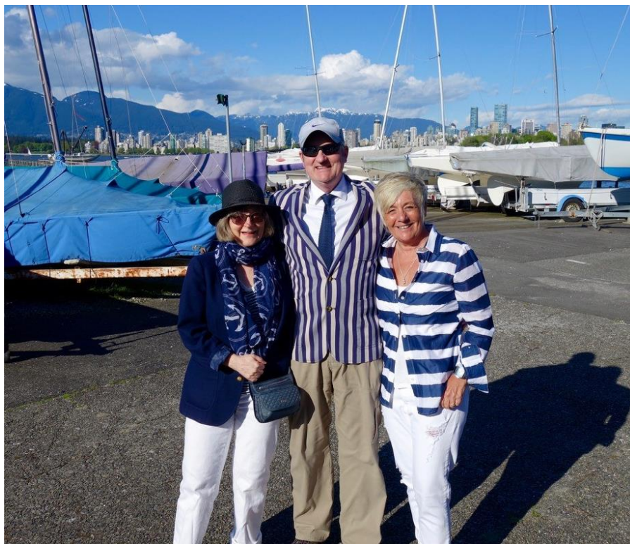
The Staff Captain, Rear Commodore and Membership and Volunteer Director enjoying the sunshine