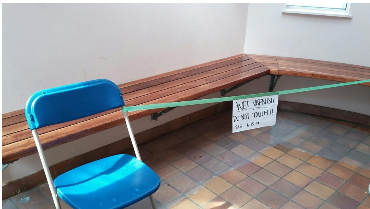
The beautiful cedar has been restored