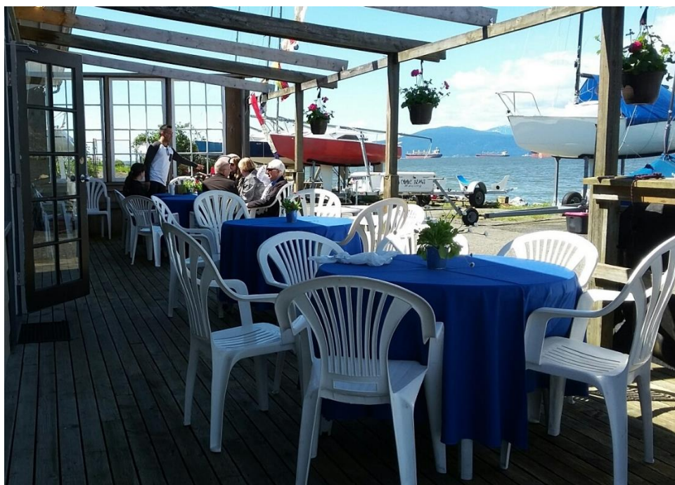
Waiting for sailors and guests to arrive