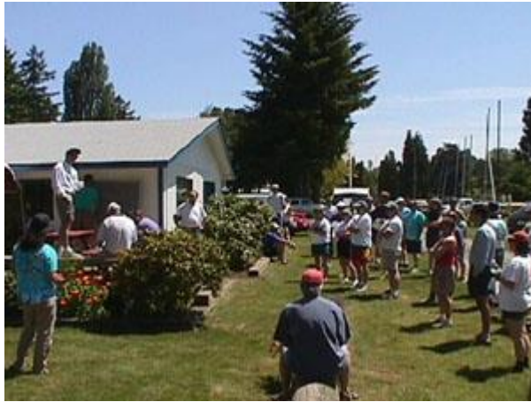
Vancouver Lake Sailing Club clubhouse and grounds

Vancouver Lake sailors are great supporters, and tough competitors, for our Kits Invitational Regatta.