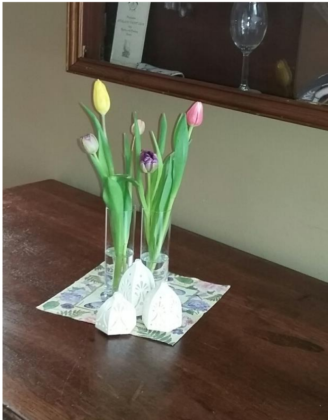
Spring tulips were waiting at the door to welcome members

April 27 was the start of Thursday nights for 2017 and it was a cool evening that looked grey and threatening but the sun did come out and it turned into a pleasant evening. The rain held off until everyone was in the clubhouse. April 27 th was also the last Thursday in April and the theme of the evening was "Welcome Spring". It was quite cool but members did show up in spring colours, with extra layers for warmth, and we welcomed spring with decorations, tulips, and a Welcome Spring toast from the Staff Captain.