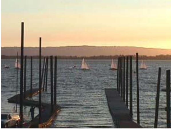
View of Vancouver Lake dock