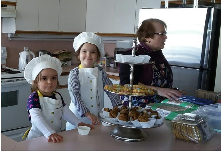
Kitchen helpers hard at work preparing for afternoon tea