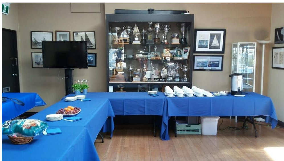
Setting up for afternoon tea