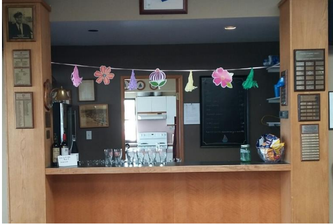
Spring decorations for the bar