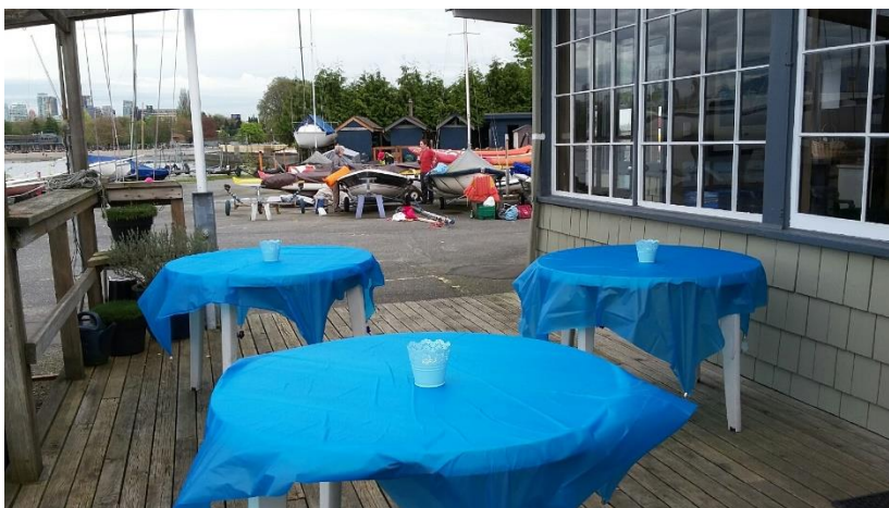
We were optimistic and set up outside....

May 4 was also our first Comfort Food and Craft Beer night and it was a big success! Ed planned a Mediterranean menu, Greek and Italian dishes, and dinner was great. We had three different craft beers from R & B Brewing and they sold out quickly!