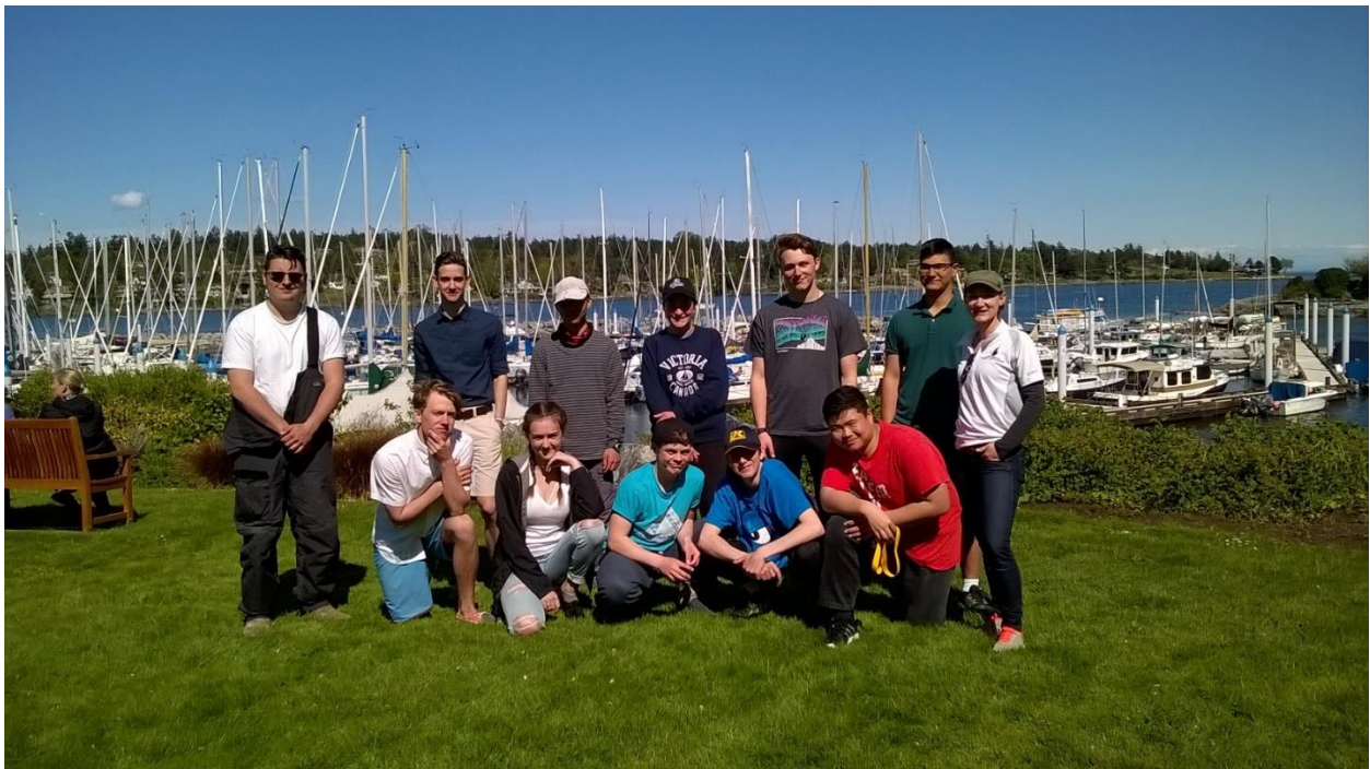
Sea Cadet sailors at Spring Dinghies in Victoria

Capt. Vancouver Sea Cadets had one team in the spring dinghies regatta in Victoria over the May 6-7 weekend. The team placed third. This is the highest placing for us in this regatta.