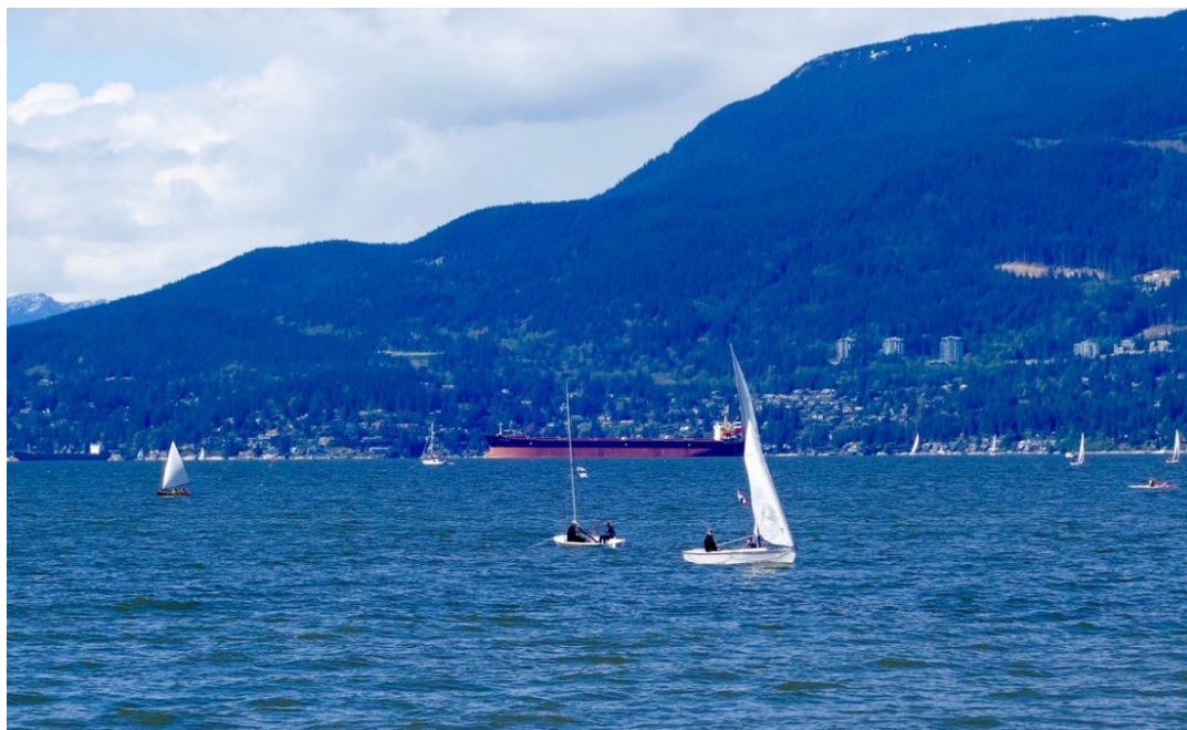
Saluting the Commodore